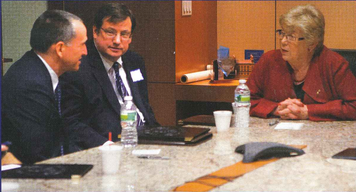
Congresswoman Carolyn McCarthy meets with members of the economic advisory board that she's forming to discuss steps to improve our economy.

This mailing was prepared, published, and mailed at taxpayer expense.