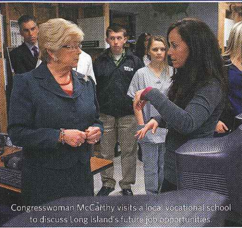
Congresswoman McCarthy visits a local vocational school to discuss Long Island's future job opportunities.